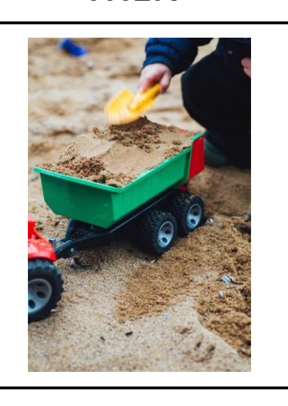
Always a task