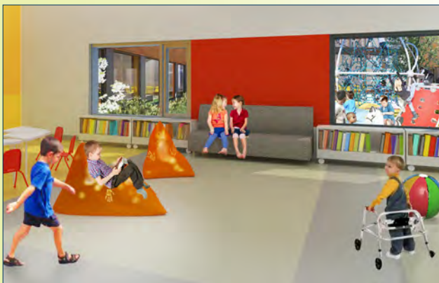
THERAPEUTIC TREATMENT AND PLAYROOM