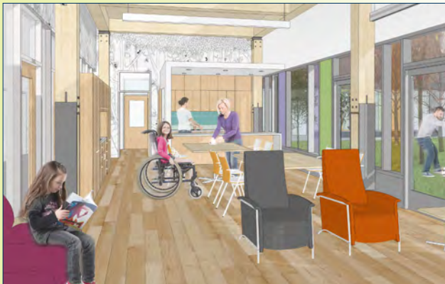
BRAMPTON/CALEDON REGIONAL RESPITE CENTRE