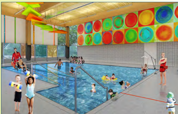
BRAMPTON/CALEDON THERAPY POOL